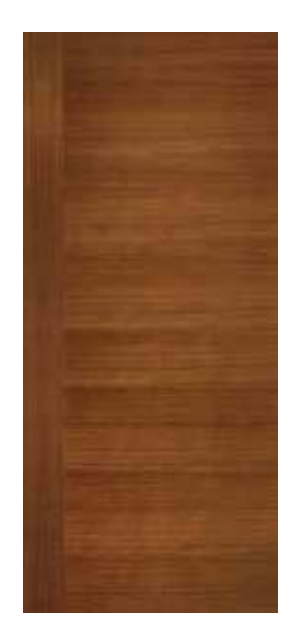
BLACK WALNUT Sketch Face Quarter Sawn