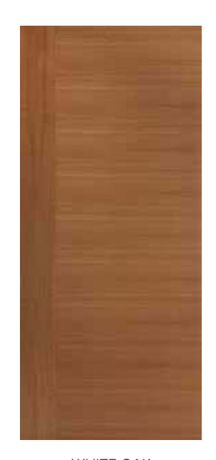
WHITE OAK Sketch Face Rift Cut