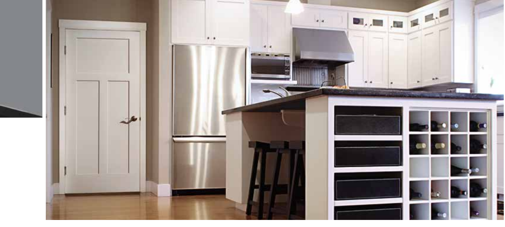
Molded doors have become an major influence in the residential and light commercial built environment.

With Lynden Door's extensive collection of smooth and textured molded profiles, a design is made to suit virtually every taste and decor. Offered in both raised and flat panel profiles, molded panel doors are an attractive fit for both traditional and contemporary spaces with flexible construction in hollow or solid core and rated/non-rated options.