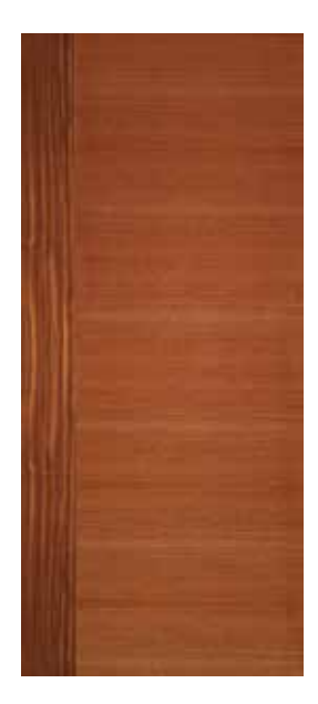
AFRICAN MAHOGANY Sketch Face Quarter Sawn