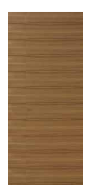
TABLEAU Horizontal Grain Shown in Walnut