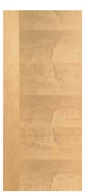
WHITE MAPLE Sketch Face Plain Sliced