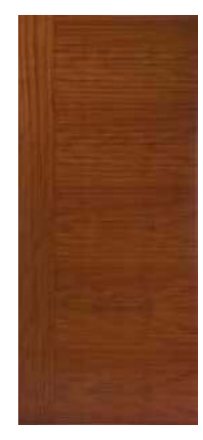
RHYTMUS Sketch Face Shown in Jatoba